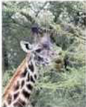
Giraffe eating leaves