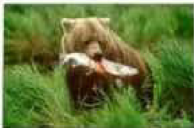
Bear eating fish