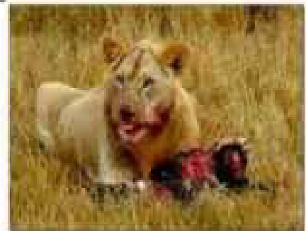
Lion eating meat